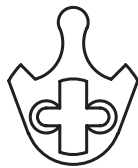
Cloverleaf – CL (standard cam)