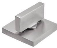
RM61-Q Rectangular Square Rose