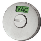
EMTI-V0 with VAC/OCC indicator window