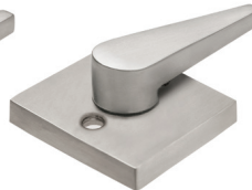
R71-Q Accessibility Square Rose