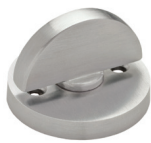
M61 Round Smooth Rose