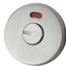
EMTI with color indicator window