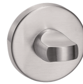
A59 Smooth Rose