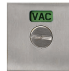
EMTI-Q-V0 with VAC/OCC indicator window