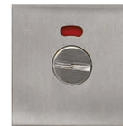
EMTI-Q with color indicator window