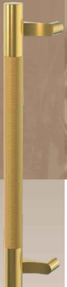
DPA4285-1.25" DOOR PULL

Your residents expect hardware that performs flawlessly for years to come. Frascio combines elegant Italian design with robust, commercial-grade American engineering. Our products are specifically verified for hospitality and multi-family residential use, ensuring they withstand high-traffic, high-use environments throughout the life of your project. That means fewer maintenance calls, happier residents, and lower long-term operational costs.